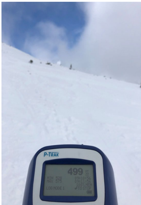
Stary Smokovec, March 7 th 2020