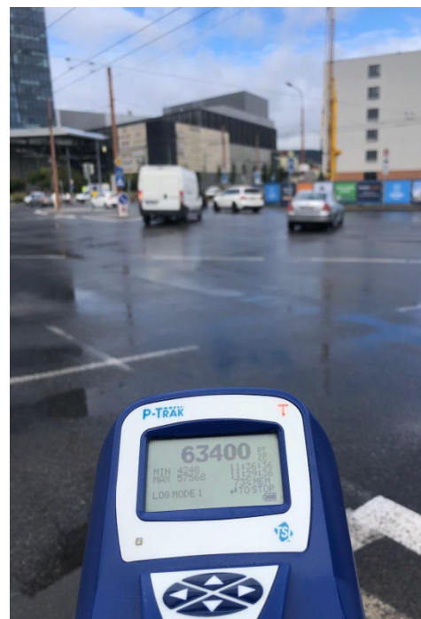
Air monitoring station in Bratislava, Sep 19 th 2022

Old diesel without filter pollute a lot (Trnava, Sep 20 th )