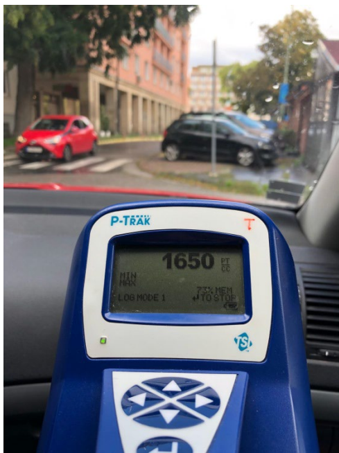
Inside car in Bratislava