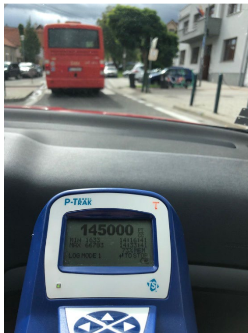
behind old bus with no filter