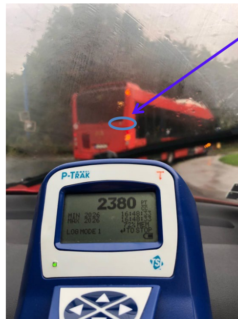
behind CNG bus , Sep 19 th 2022