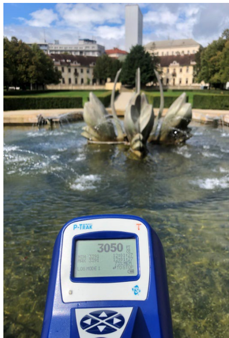
Park in Bratislava, Sep 19 th 2022